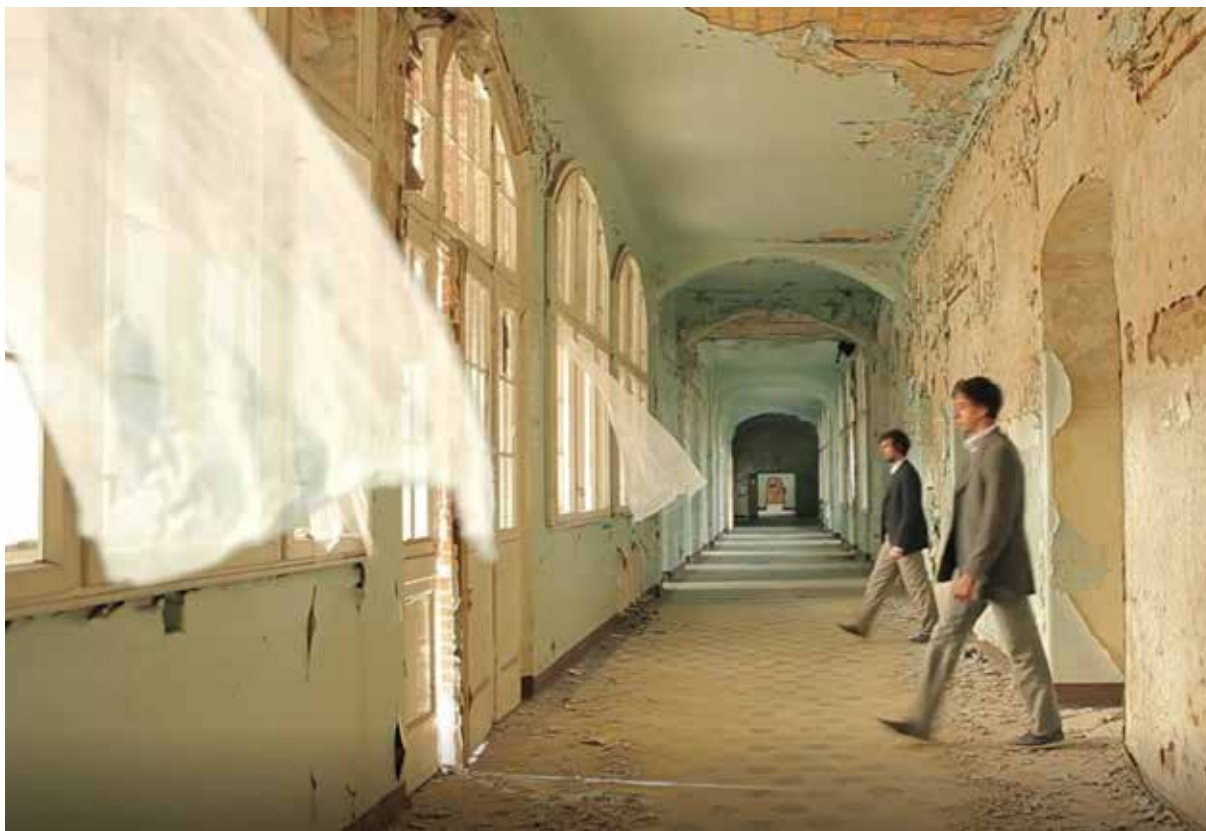
Still from movie Ballets Beelitz

Ahmedabad, Delhi, Chandigarh, Pune, Hyderabad, Bangalore, Kolkata, Puducherry