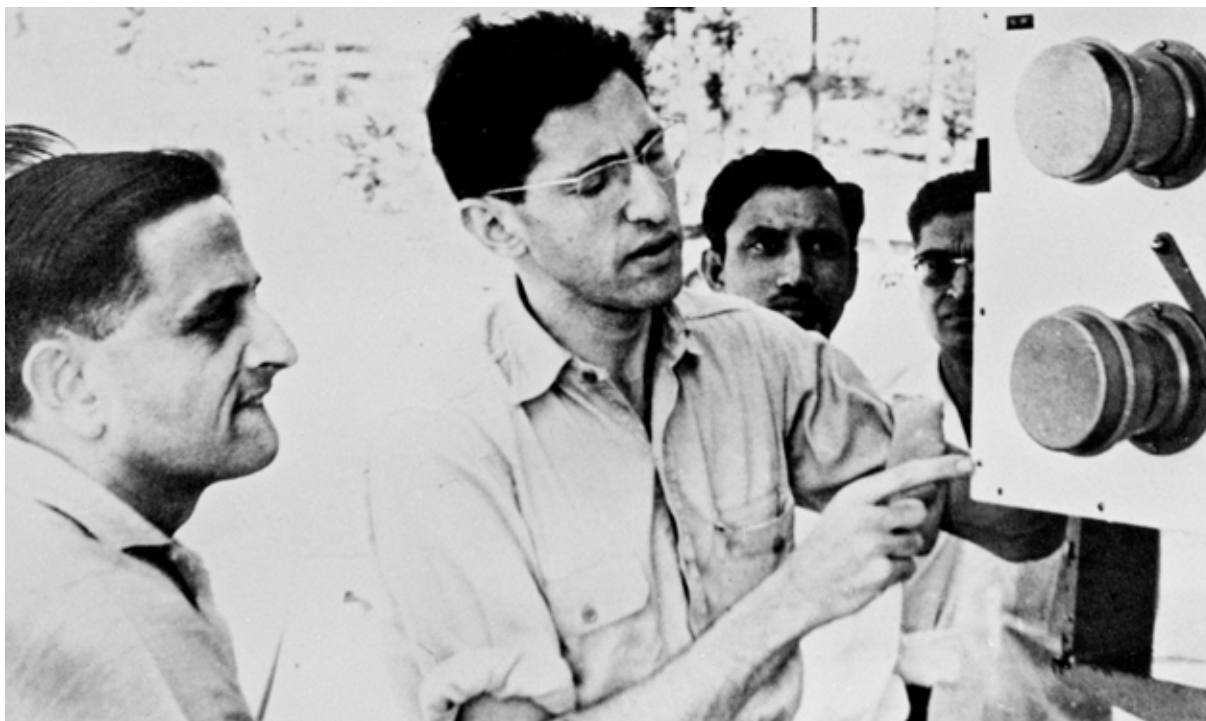
Jacques Blamont and Vikram Sarabhai in Thumba