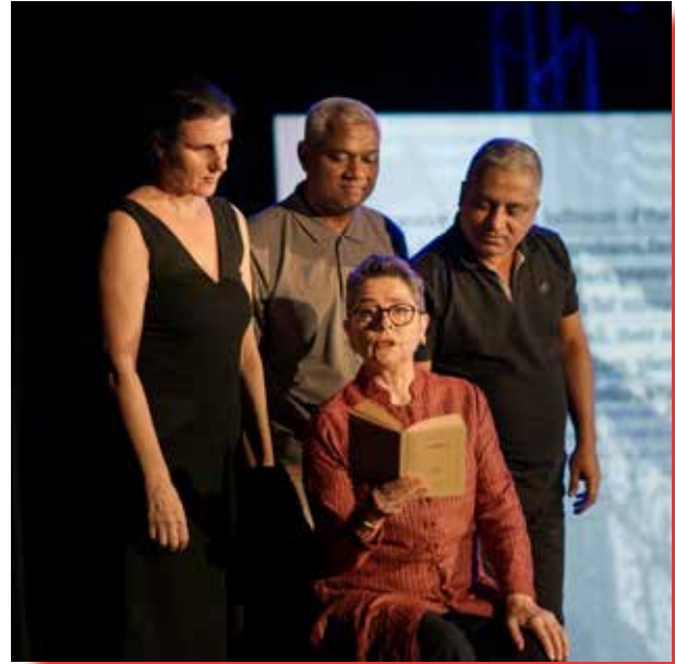
S.Thala © Compagnie Annette Leday/Keli

A unique moment of poetry marrying dance, French literature and Indian gestures