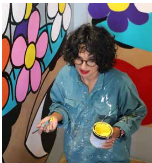
Bangalore, Bhopal, Chandigarh, Jaipur, Lucknow, Gurugram (WB)

Wall Art Festival, in collaboration with Wicked Broz (WB), crossing many parts of the country aims to highlight that in 2022, equality is not a choice but a necessity.