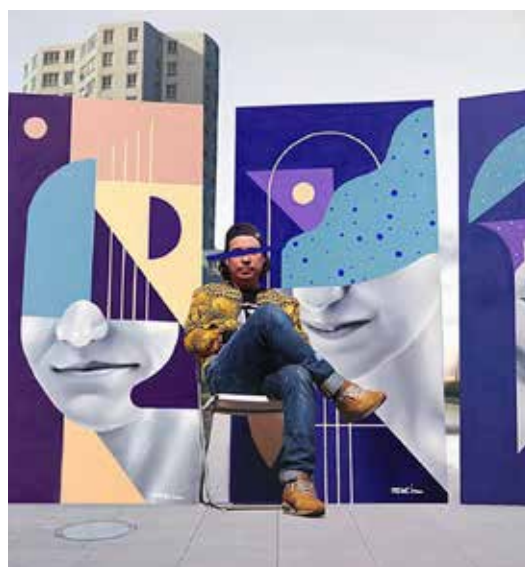
Kolkata, Mumbai, Puducherry, Dehradun (WB), Noida (WB)