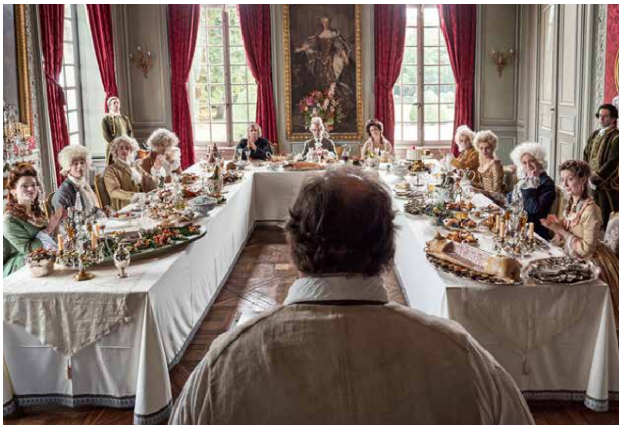
Still from movie Délicieux

Mumbai, Delhi, Bangalore, Hyderabad, Kolkata, Chandigarh, Lucknow, Bhopal, Ahmedabad, Puducherry