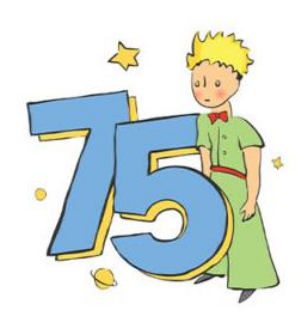
Le Petit Prince ®